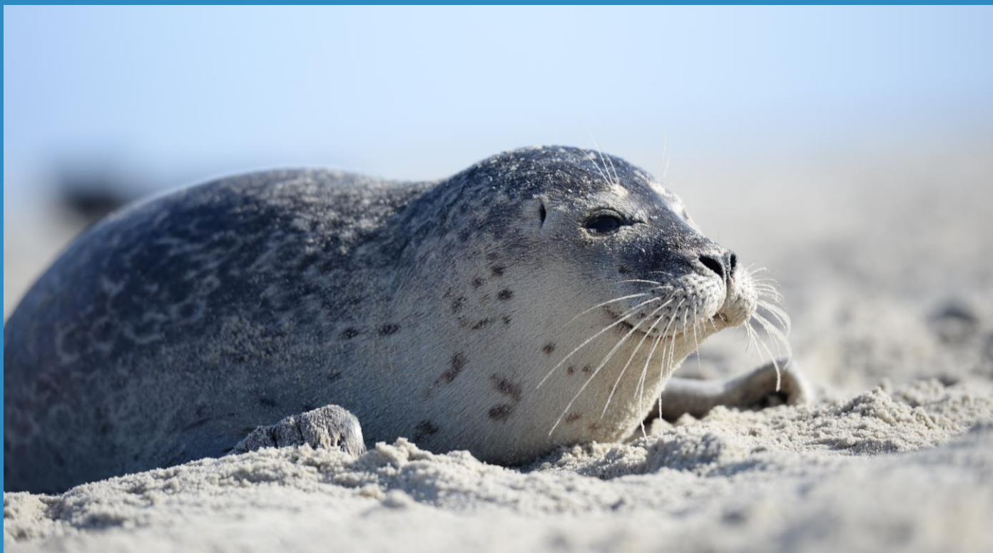
Figure 1: Harbour seal ( Phoca vitulina ) in Kattegat.