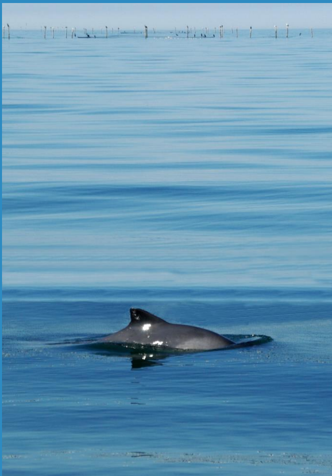
Figure 2: Harbour porpoise ( Phocoena phocoena ) in the Great Belt.

The global population of harbour seals is estimated at 315,000 mature animals and the species is listed as Least Concern on the IUCN Red List (Lowry, 2016).